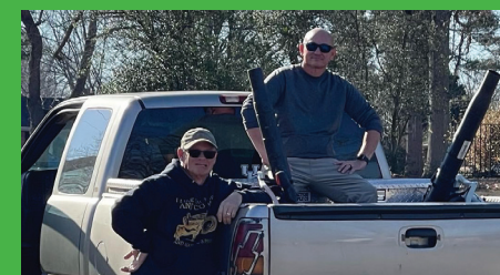
CCK Facilities staff waiting to put tools and skill to helpful use.