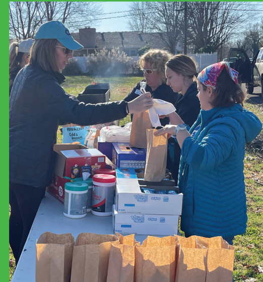
Packing lunch bags for anyone who is hungry.