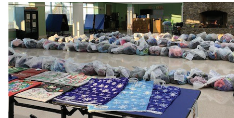
Warm coats ready and waiting to be picked up

This holiday season, CCK was honored to do something very special for the local families of our Allen County community. Cubby's Coats for Kids is a free program specializing in warmth and hope. With the sponsoring support of the Elizabeth Turner Campbell Foundation, CCK opened our Dining Hall