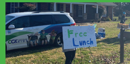
Setting up to prepare a hot meal.

The Center for Courageous Kids needs enthusiastic and energetic volunteers all year round! If you are in search of an experience that will build your resume but also build your sense of self, make your impact as a volunteer at CCK. Earn volunteer service hours while making a difference in the lives of our courageous kids. There are several options that fit in everyone's schedule: • a weekend in the fall or spring • a week in the summer • for a couple of hours in our Horse Barn or Dining Hall For more information: volunteer@courageouskids.org